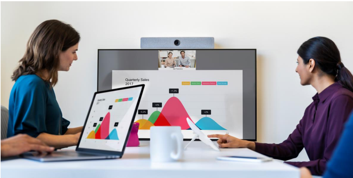
Figure 1. Cisco Webex Room Kit Mini in a Small Room

The Room Kit Mini is ideal for huddle spaces with three to five people because of its wide 120-degree field of view, which allows everyone in a huddle space to be seen. It also offers the flexibility to connect to laptop-based video conferencing software via USB. The Mini is tightly integrated with the industry-leading Cisco ® Webex platform for continuous workflow, and can register on premises or to Cisco Webex in the cloud.